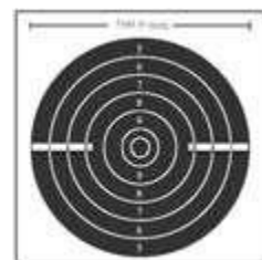
ISSF 25m Rapid Fire Pistol Target

ISSF 25m Rapid Fire Pistol Target Targets are scored at the target line.